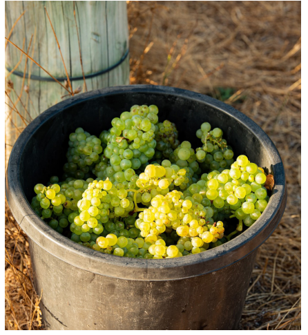
The first pick is always chardonnay.

Down at the Chapman Brook and Crossroads vineyards (20km south of Margaret River) the portents are good too. The chardonnay blocks are also showing good canopies, which will assist the development of fruit elegance and balancing acidity. As ever, the vintner's fingers are crossed!